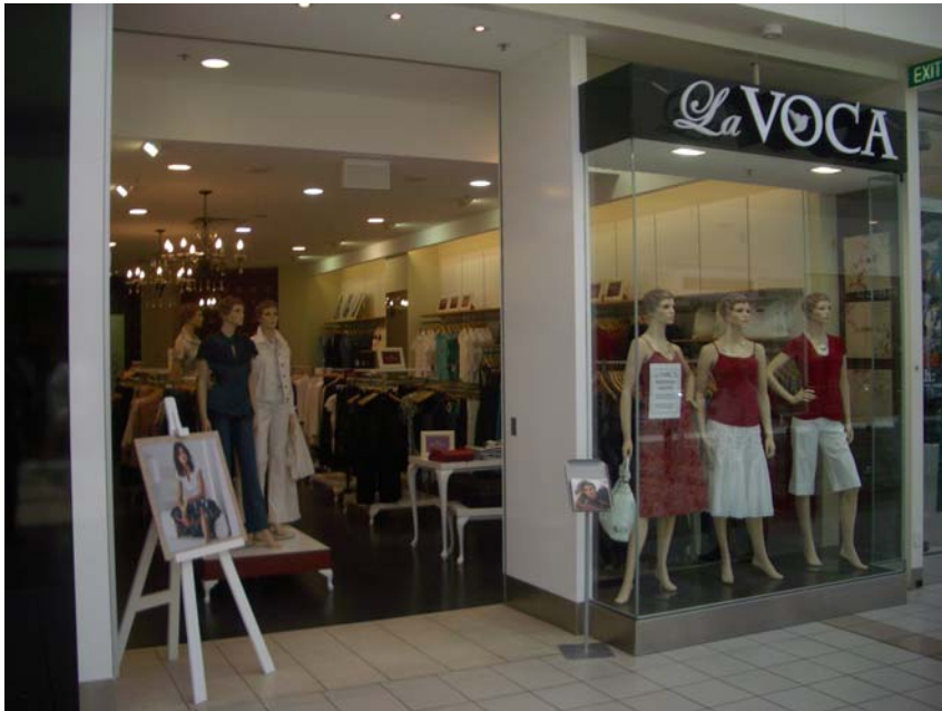
La Voca - Canberra Centre, ACT